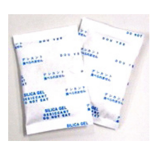
Figure 1b. Desiccant