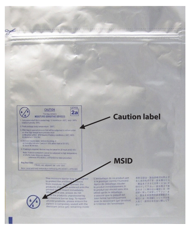
Figure 1a. Moisture barrier bag, MSID and Caution label