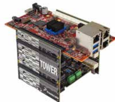
Figure 1. TWR-LS1021A module (TWR-LS1021A, TWR-SER-IO and TWR-ELEV)